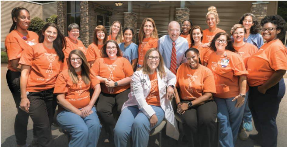
Team members of the Magee Division of Reproductive Endocrinology & Infertility.