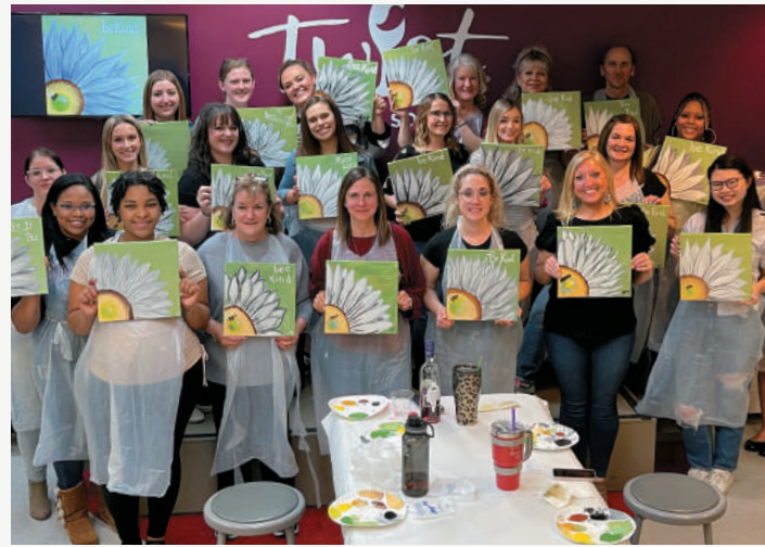
In April 2022, the Diagnostic Imaging Department at UPMC Magee-Womens Hospital visited Painting with a Twist in South Side Flats.

Over the past year, Magee and the larger UPMC organization have continued and enhanced employee engagement work that's been ongoing for years, with a focus on showing gratitude and appreciation for everyone who makes life-changing work happen in the hospital and beyond. Leaders engage with their teams through "rounding" and one-on-one conversations as well as handwritten thank-you cards for staff who may have gone above and beyond. The hospital offers resources like respite rooms when an employee needs a moment. And new programs have created career growth opportunities and flexibility.