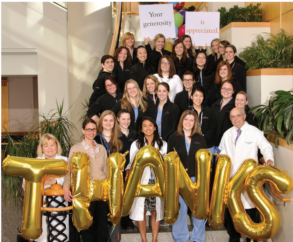
Congratulations to the resident class of 2014.