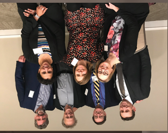
Magee was well represented at SMFM's 38th Annual Pregnancy Meeting in Dallas, TX