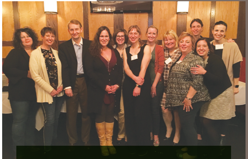
Faculty, staff and former trainees gathered in National Harbor, MD, in March for the CREOG annual meeting