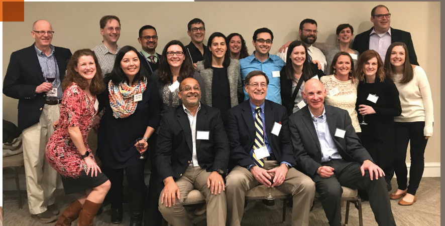
Former and current fellows of the MFM program joined current and former residents and faculty at the annual SMFM meeting in Dallas, TX, in February