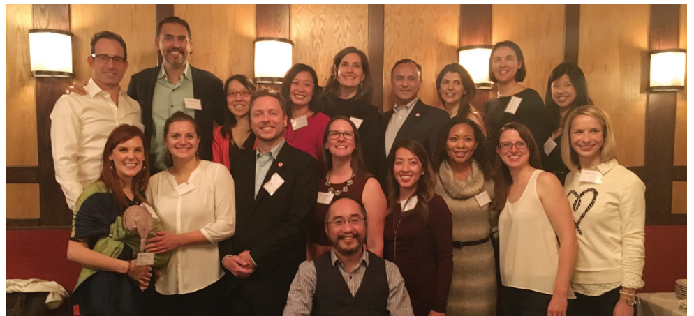
During the AAGL annual meeting, minimally invasive gynecologic surgeons including current Magee faculty, trainees, and alumni gathered in National Harbor, Maryland.