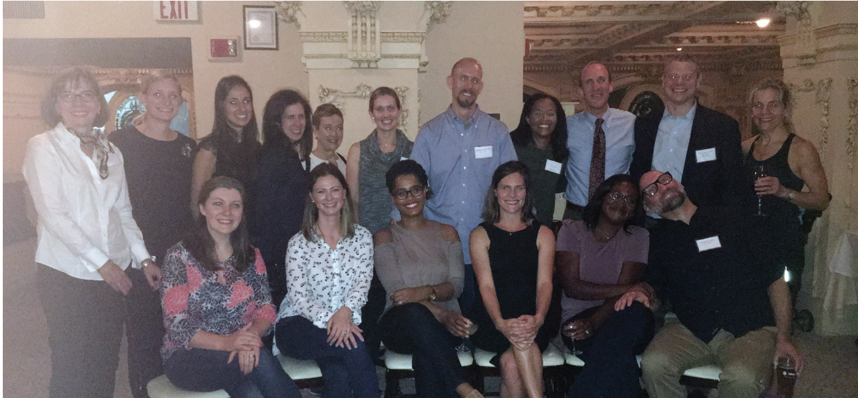
During the AUGS Annual Meeting in October, the urogynecological faculty, trainees, and alumni gathered in Providence, Rhode Island.